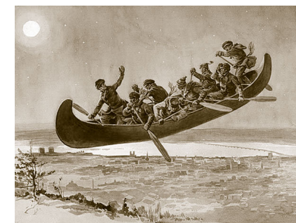
La Chasse-galerie by Henri Julien, 1906, Musée national des beaux-arts du Québec

La Chasse-galerie also known as "The Bewitched Canoe" or "The Flying Canoe" is a popular French-Canadian tale of Coureurs des bois who make a deal with the devil, a variant of the Wild Hunt. Its best-known version was written by Honoré Beaugrand (1848–1906). It was published in The Century Magazine in August 1892.