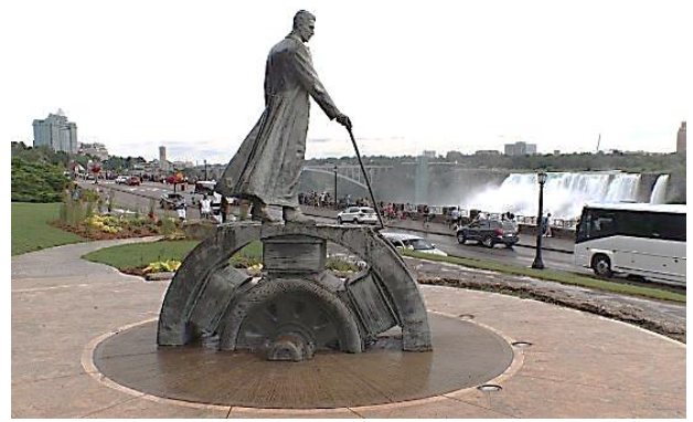
Photo : Nikola Tesla statue at Niagara Falls, ON

With Nikola Tesla so that he can fill me in on his inventions, especially those of wireless electricity!