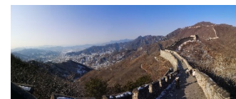
Ahhh, China !

A. History, travelling, philosophy and political science.