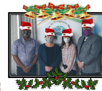
From the AMR team:

It was the first, now, come and share our culture!