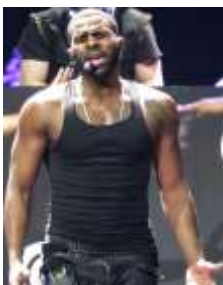
Jeson Derulo (Rapper)

Q. What would you like to see written on your tombstone?