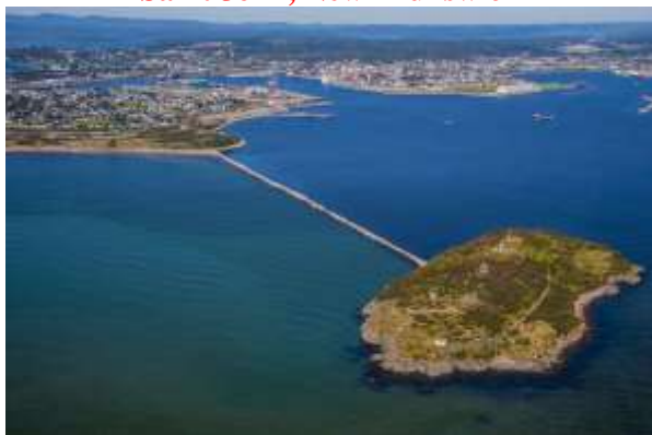
Photo: aerial view of Saint John, NB and Partridge Island

Q. You chose New Brunswick (NB) or it chose you?